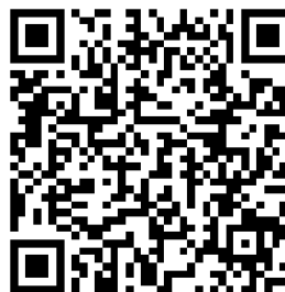
MASAMITSU V4 APP.

The above mentioned technical drawings are for reference only.